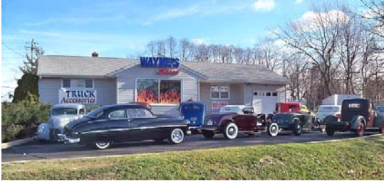
Car Line Up in front of Wayne's Speed

South Amboy, NJ – A Toys-for-Tots event took place at Wayne's Speed in South Amboy on Sunday, December 5, 2010. It was pretty cold for a car show, but the Marines came away with a good quantity of toys.