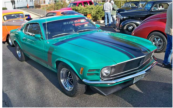
1970 Boss 302 Mustang