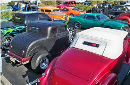
More in the back lot